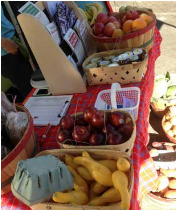
DOUBLE BUCKS PROGRAM