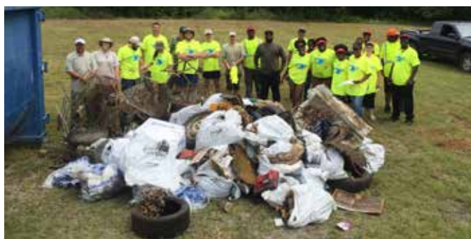
VALLEY CREEK CLEANUP

JCDH Environmental Health is also making progress in policy promotion including policies related to trails and parks supporting physical activity. To support public investment in parks and trails, JCDH coordinated the May 2016 opening of the High Ore Line Trail with the Freshwater Land Trust, the Community Foundation of Greater Birmingham, the City of Midfield and the City of Birmingham. The High Ore Line Trail is located approximately four blocks from JCDH's Western Health Center. Trail users are encouraged to park at the Western Health Center. Additionally, JCDH funded a phone survey of residents in the seven neighborhoods adjacent to the High Ore Line Trail regarding knowledge of the trail, current physical activity and trail use. The analysis of survey responses was provided to neighborhood officers, the High Ore Line Trail Committee and other partner groups.