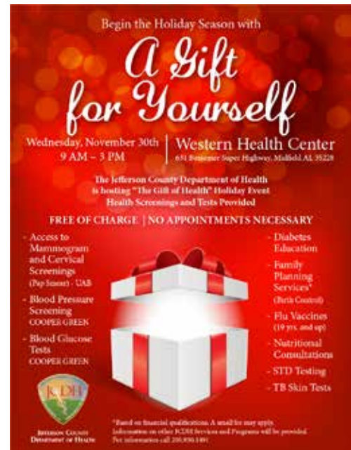
GIFT OF HEALTH